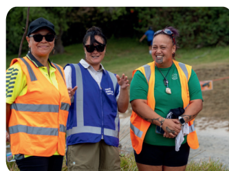
Kaimahi, tamariki and community support for the realease of green turtles at Rangiputa