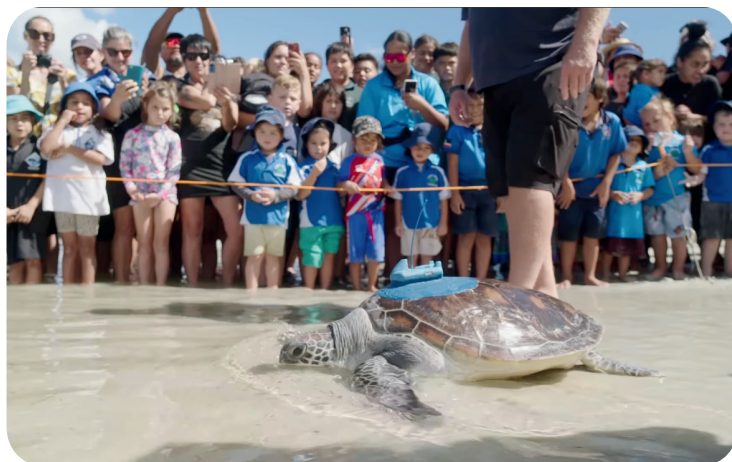
Pūmautahi, green turtle released at Rangiputa

Ngā mihi nui to our whānaunga nō Ngāti Kahu for your manaakitanga and hosting two incredible days, Auckland Zoo, and SEA LIFE Kelly Tarlton's - for their expertise and dedication to marine conservation. Here's to many more moments like this, where our taiao, community, and science come together to make a difference.