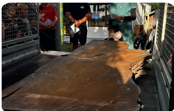
Kauri slabs from Ngāi Takoto

“Whāia te iti kahurangi, ki te tūohu koe, me he maunga teitei”