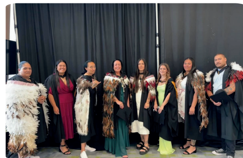
Te Hiku BTeach Graduation, Tauranga