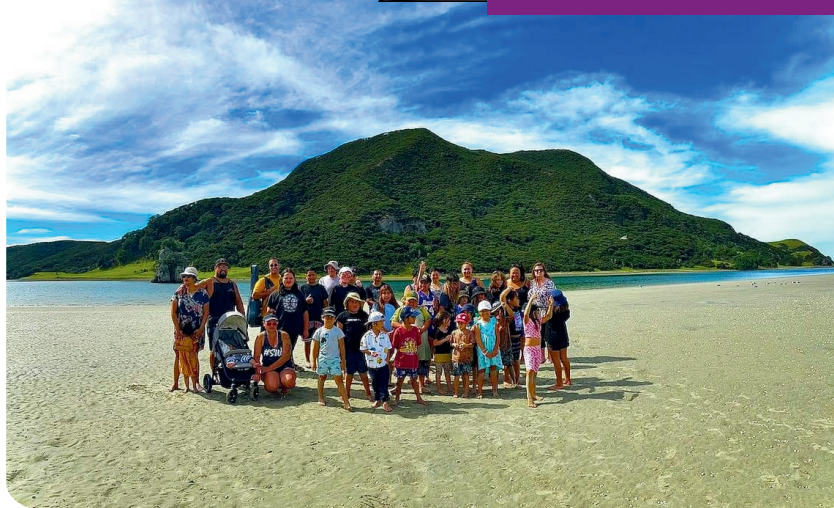
Waihārara school students and whānau picture in front of Maunga Tohoraha

Soon, a waharoa will proudly adorn the grounds as a reflection of their journey, values, and the strength of the school's whānau and Ngāi Takoto Iwi. The day's events showcased not just the growth of the kura, but the deep sense of community and cultural pride that will continue to guide it forward.