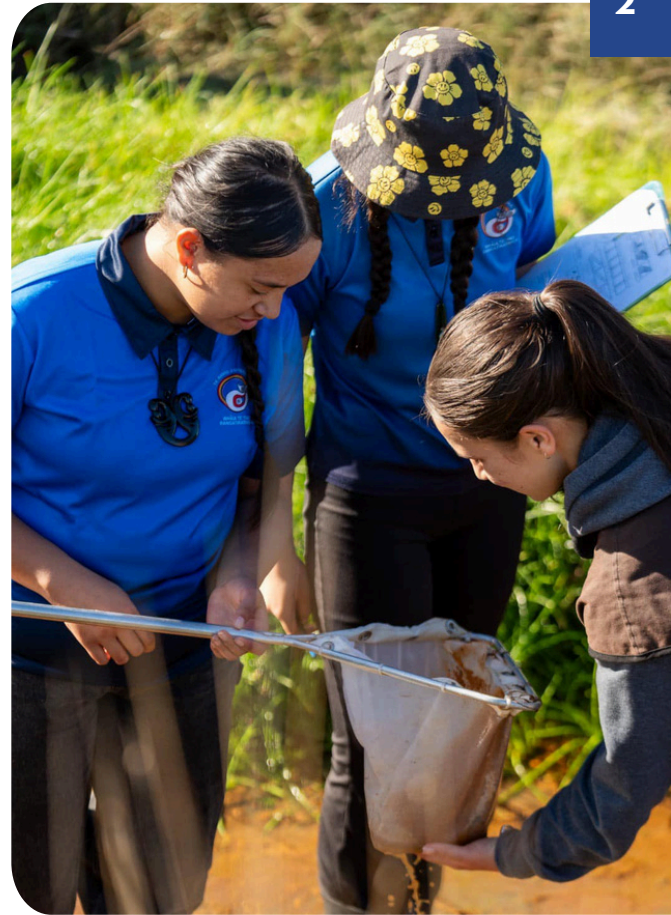
TKKM o Te Rangianiwaniwa students, Wānanga 2025

A highlight was hosting a hands-on wānanga with Te Kura Kaupapa Māori o Te Rangi Aniwaniwa. Tamariki visited sites of significance to the project as part of their science learning, connecting classroom knowledge with real-world environmental research.