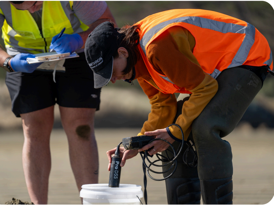
Crawthron visit to Te Oneroa-ā-Tohe, water quality testing, 2025