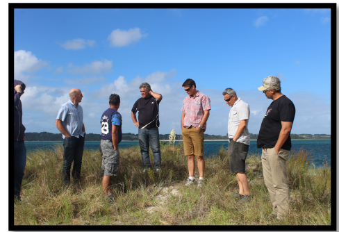
Kaimaumu Beach Area

The weekend comprised of clarifying Governance/Management roles and responsibilities, Site visits to view the substantial NgaiTakoto Settlement Asset base, (Farms, Forest, coastline etc...) and ongoing discussions about the need for the development of a future 20/40 NgaiTakoto Business plan and within that plan, the development of a future leadership succession strategy. It was a first time opportunity for many who attended to fully understand what it is that NgaiTakoto have as a settlement asset base, and what will be required to manage those assets in the best interests of our NgaiTakoto members.