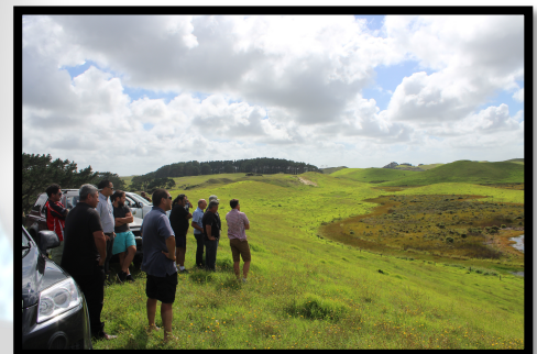
Overlooking Farm Wetlands

The following information identifies the approach that will be taken to developing that longer term strategic NgaiTakoto Business Plan: