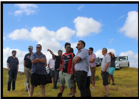
Overlooking the Sweetwater lakes

As the transfer of settlement assets comes back to NgaiTakoto (17 December 2015) the need to align that work with the development of the PSGE (Post Settlement Governance Entity) is now becoming a priority for the Iwi. Over the weekend of March 18-21 the Te Runanga o NgaiTakoto Board Trustees, Asset Management persons (Pioke Corporate), members from NgaiTakoto Australia and a number of younger generation gathered to discuss the future strategy for alignment of the Iwi's various post settlement governance entities, and how NgaiTakoto moves forward into the future.