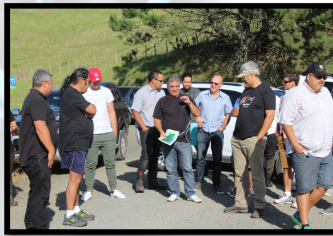
Te Make Farms - Sweetwater