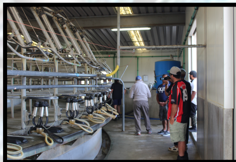
Dairy Farm Milking Unit