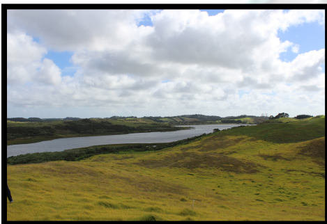
Lakes on Sweetwater Farm

The weekend comprised of clarifying Governance/Management roles and responsibilities, Site visits to view the substantial NgaiTakoto Settlement Asset base, (Farms, Forest, coastline etc...) and ongoing discussions about the need for the development of a future 20/40 NgaiTakoto Business plan and within that plan, the development of a future leadership succession strategy. It was a first time opportunity for many who attended to fully understand what it is that NgaiTakoto have as a settlement asset base, and what will be required to manage those assets in the best interests of our NgaiTakoto members.