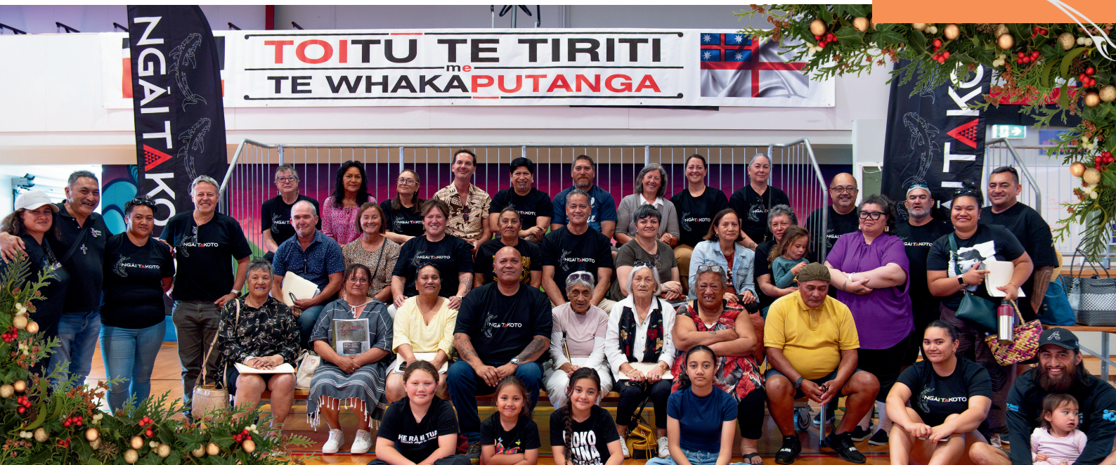
Ngāi Takoto Hui-ā-tau 2024