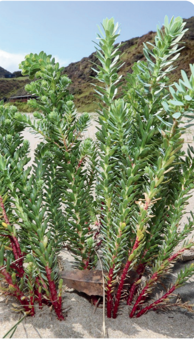
sea spurge (Euphorbia paralias)

Seen this weed on Te Oneroa-a-Tōhe/Ninety Mile Beach?