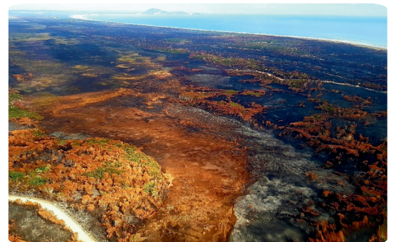
Kaimaumu fire, 2800ha burnt in December 2021