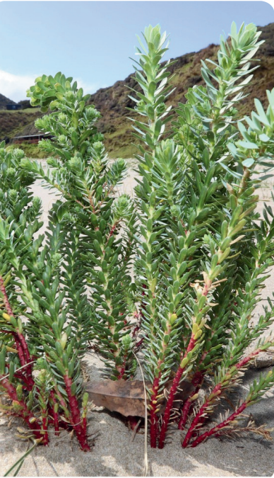
sea spurge (Euphorbia paralias)

Seen this weed on Te Oneroa-a-Tohe/Ninety Mile Beach? REPORT IT!